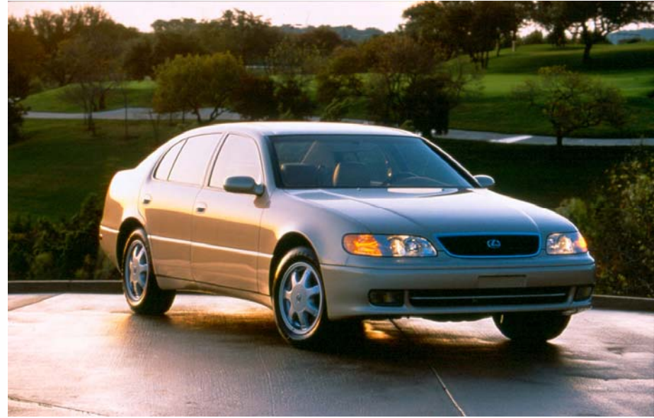
1993 GS 300