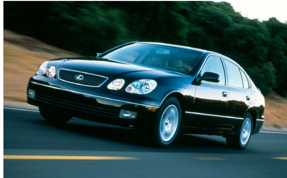
2001 GS 430