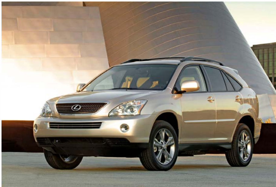
RX 400h luxury hybrid vehicle