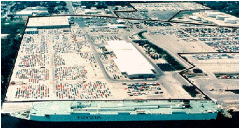
Port of Jacksonville