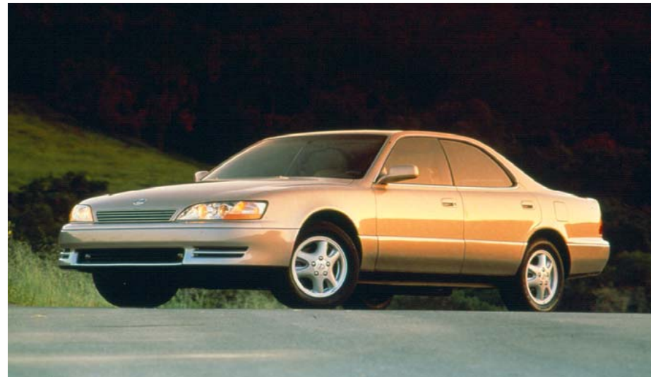
1992 ES 300