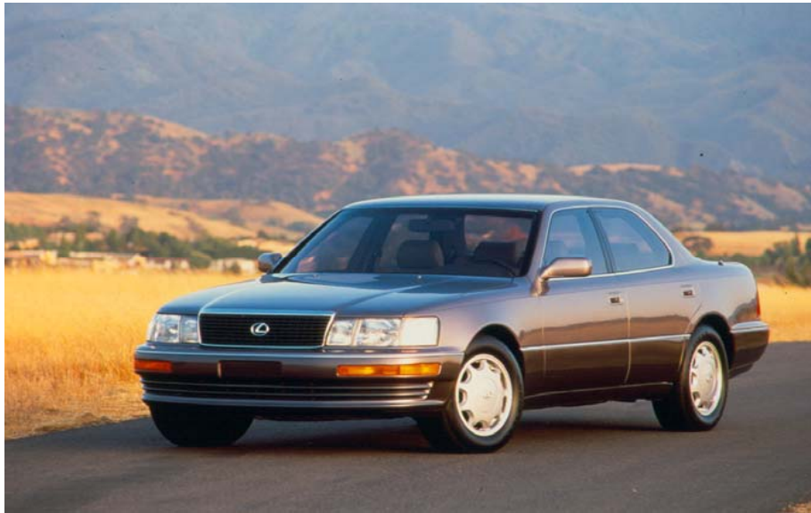
1993 LS 400