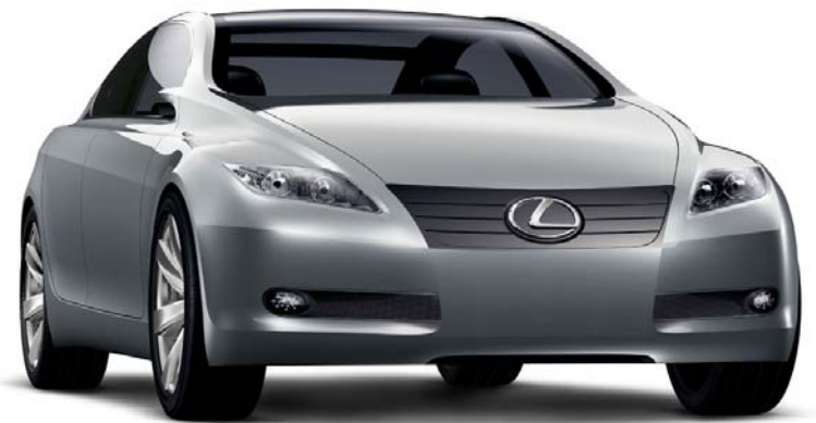
Lexus LF-S concept car