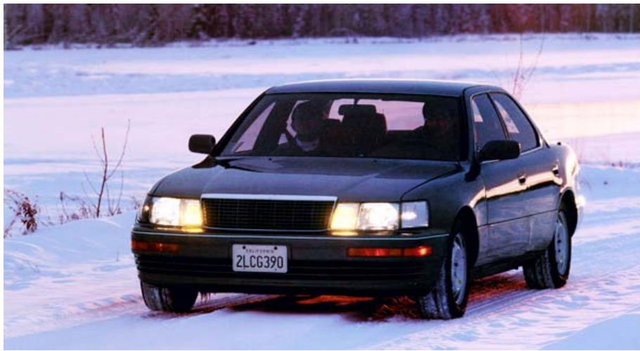
Lexus prototype in America