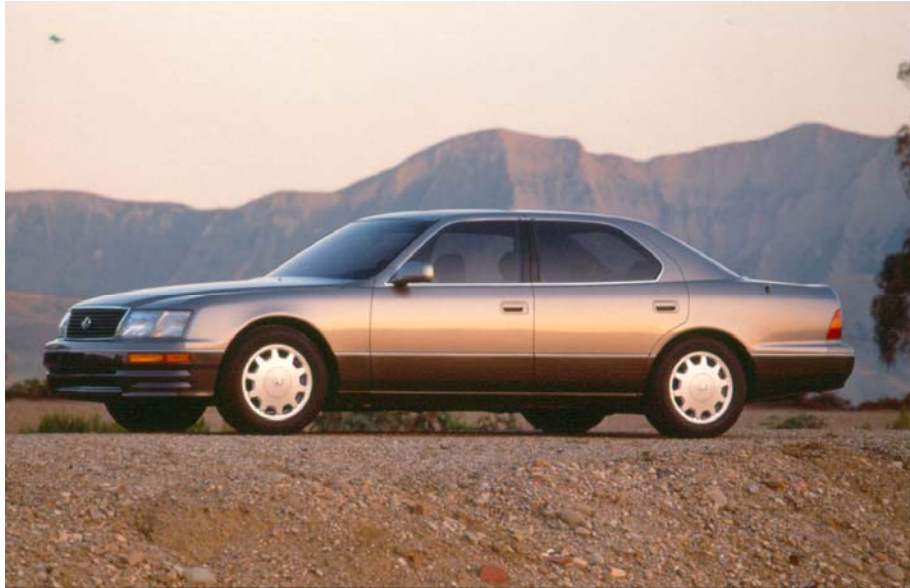
1995 LS 400