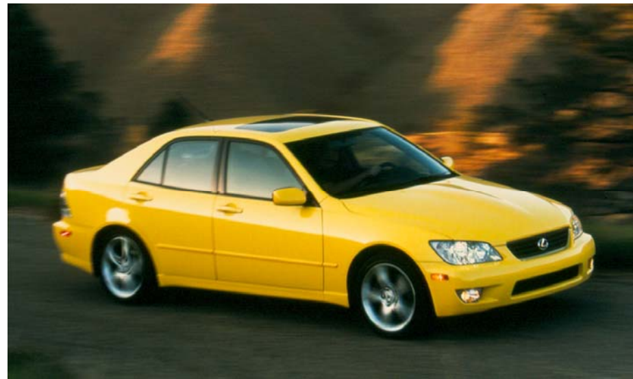
2001 IS 300