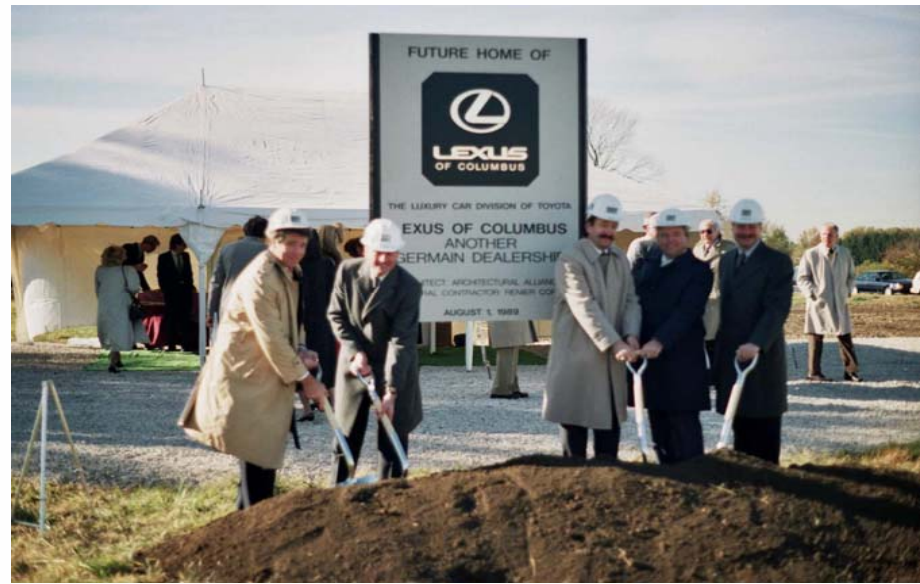
Lexus of Columbus Groundbreaking