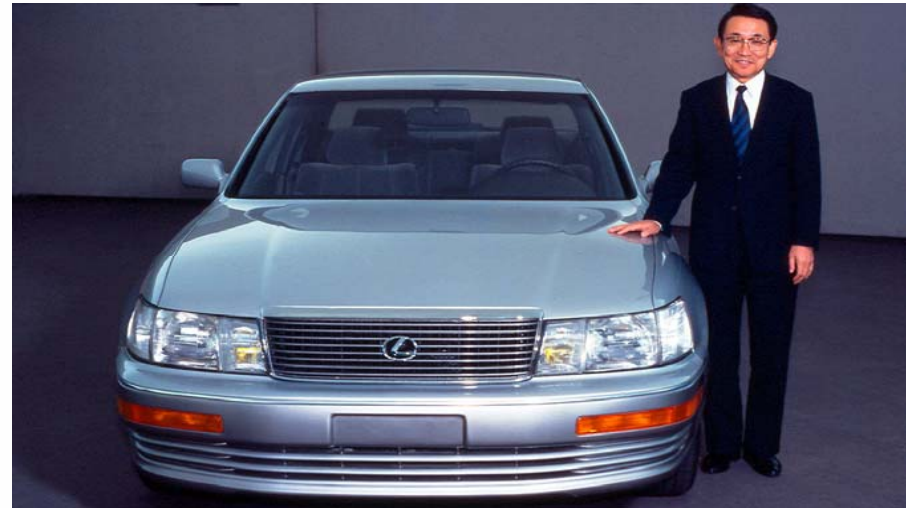
Ichiro Suzuki with an LS 400