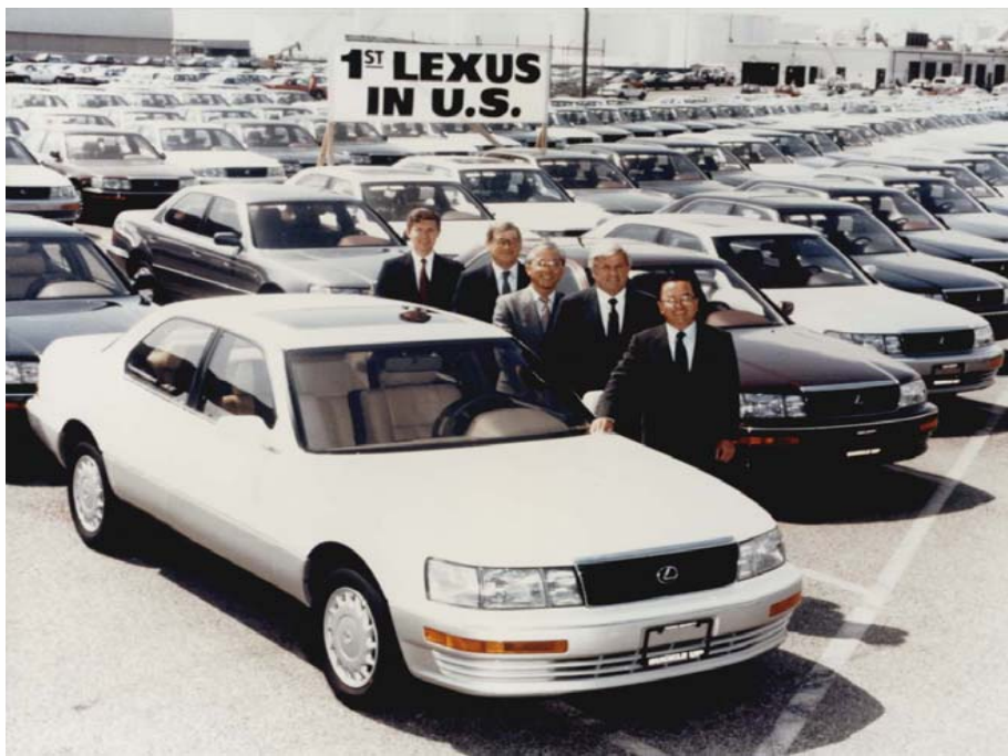
First Lexus vehicles arrive in the U.S.