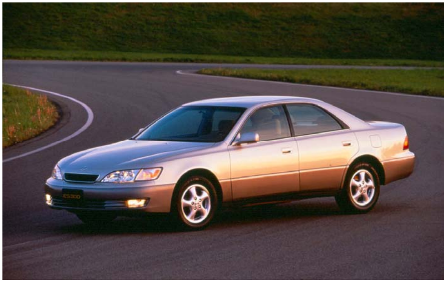
1997 ES 300