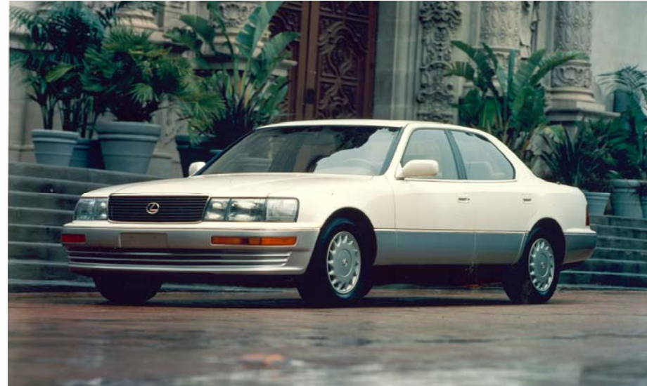
Lexus LS 400