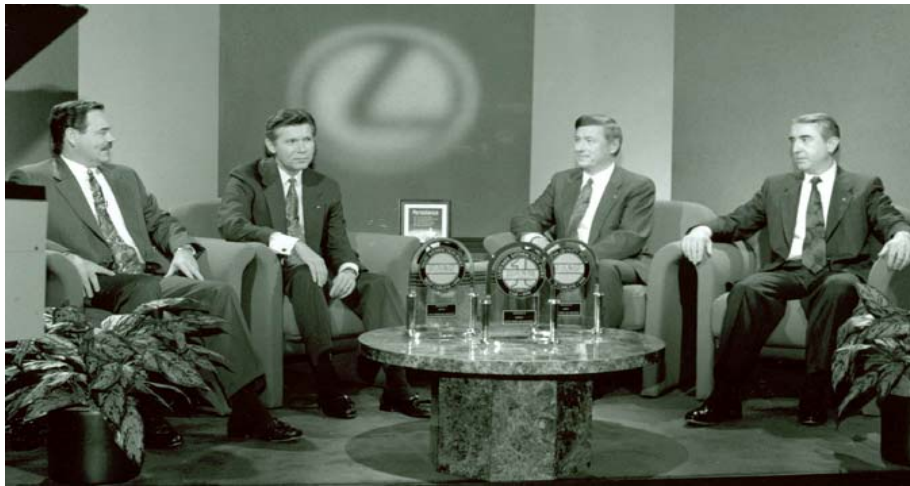
First Interactive Video Conference