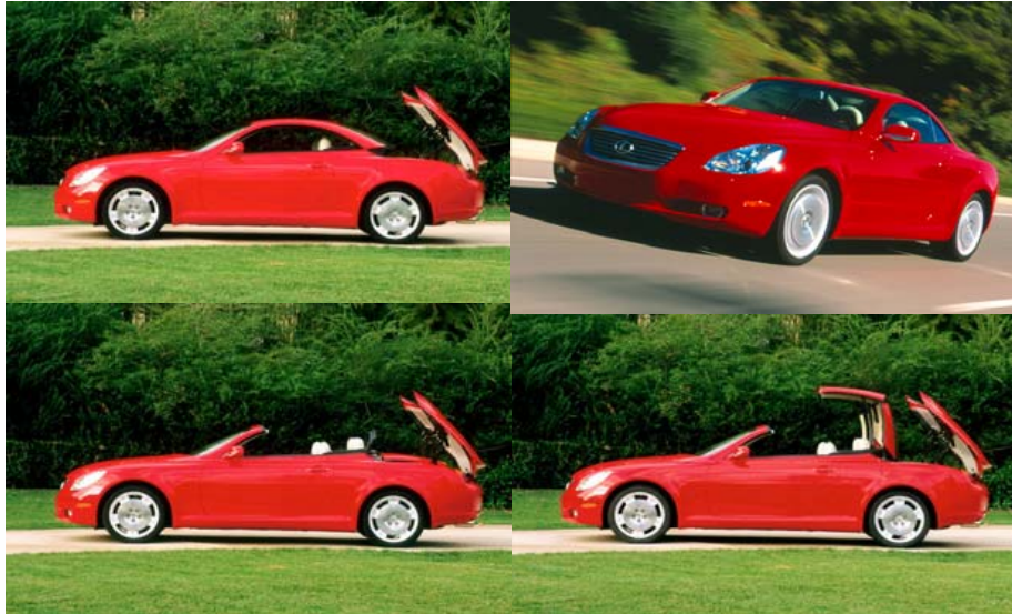
SC 430 hardtop convertible