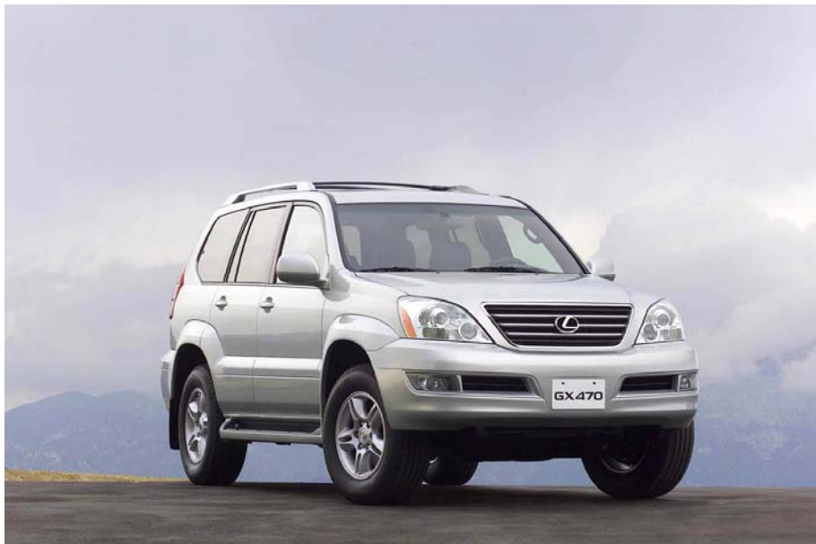
2003 GX 470