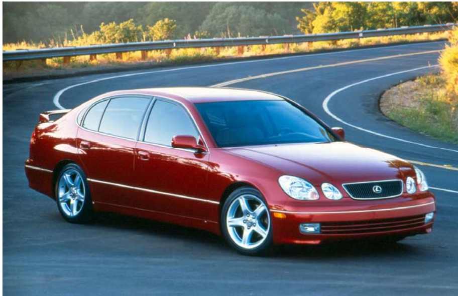
1998 GS 400