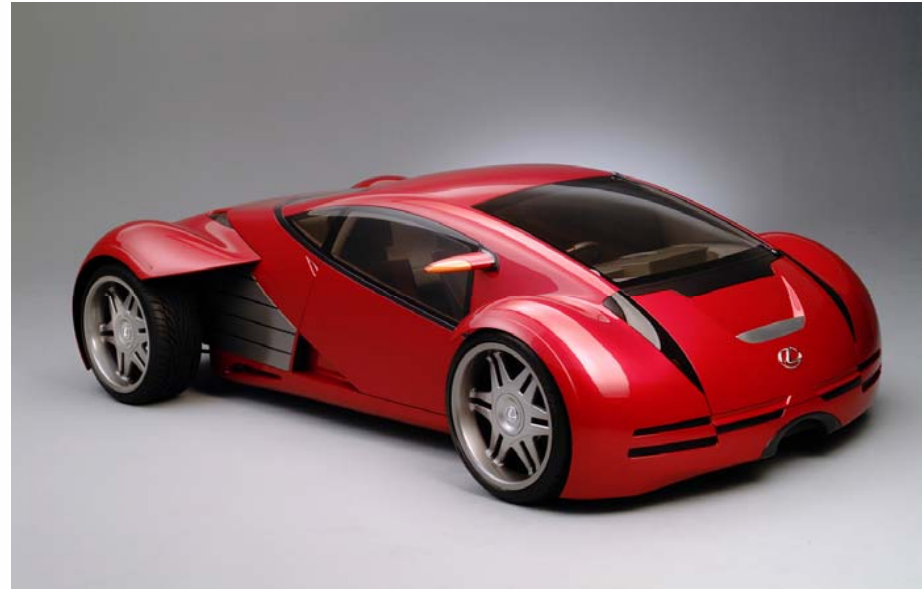
Lexus Minority Report Car