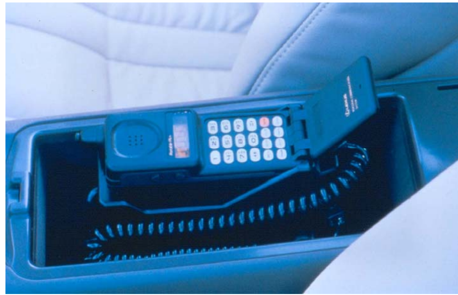
The Lexus Portable Plus Cellular Telephone