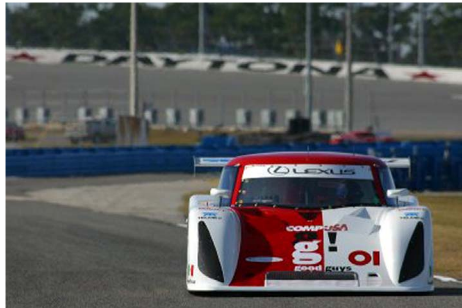
Lexus Racing at Daytona