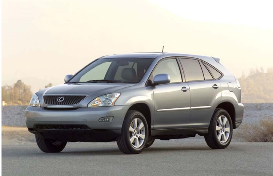
2004 RX 330