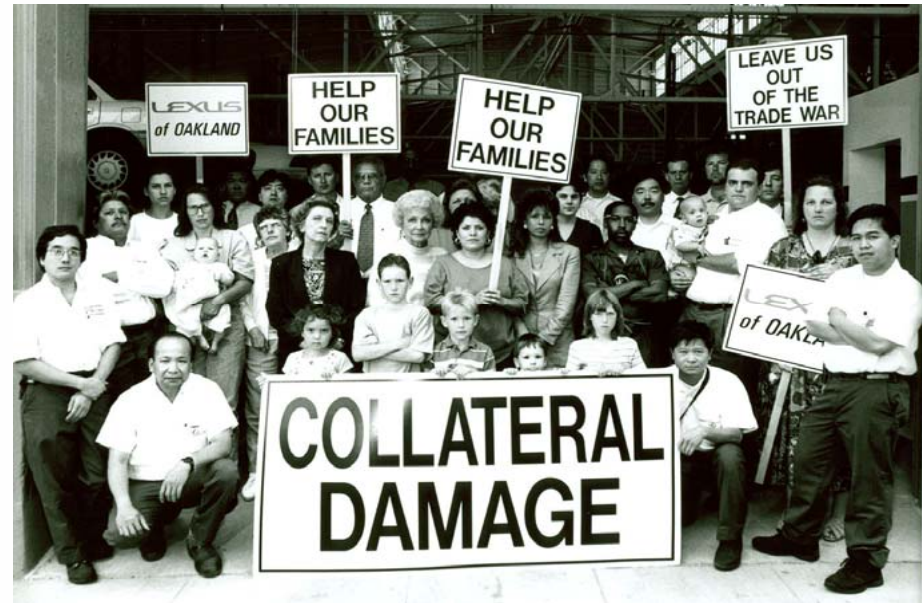
Dealerships support Lexus in opposing a proposed luxury car tariff