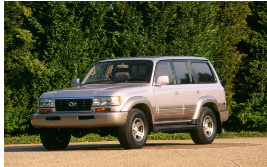
1996 LX 450