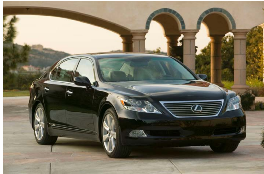
2008 LS 600h L