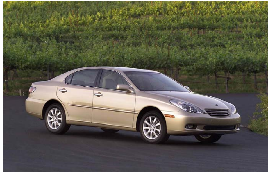
2002 ES 300