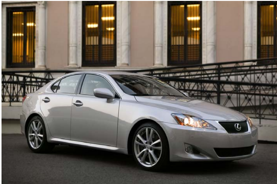
2006 IS 350