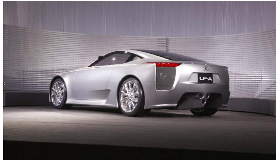
LF-A concept car