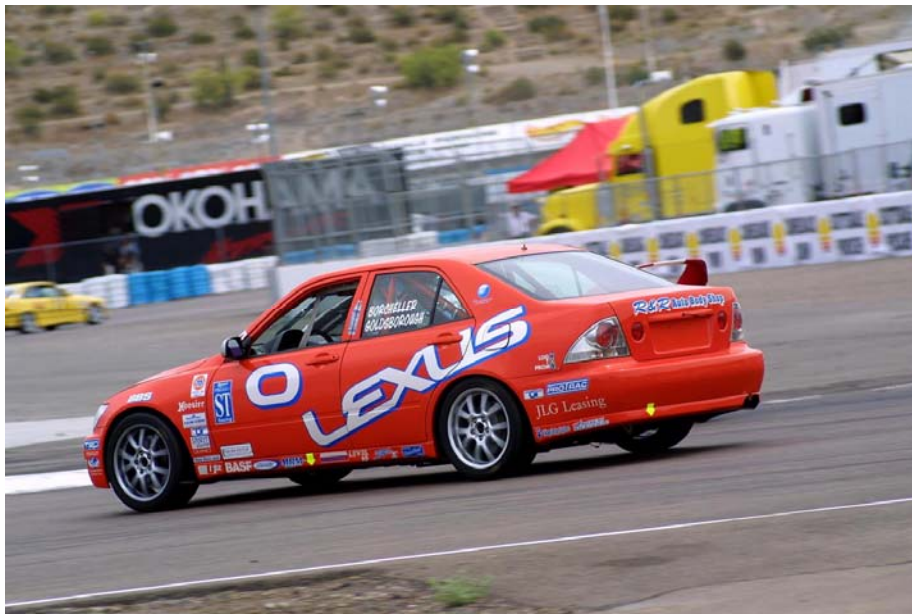
Lexus IS 300 pace car at the Marlboro 500 in Phoenix, Arizona